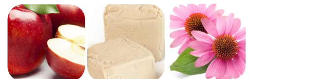
Apple Beta-glucan Echinacea