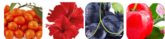
Sea buckthorn Hibiscus Red grapes Acerola