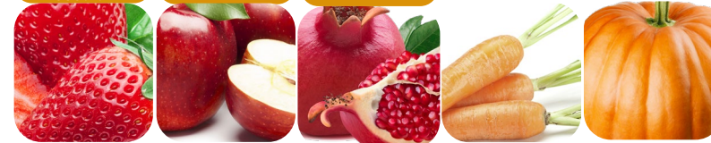
Strawberry Apple Pomegranate Carrot Pumpkin