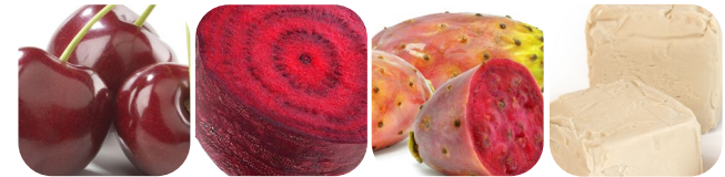
Sour cherry Beetroot Prickly pear Beta-glucan