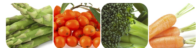
Asparagus Sea buckthorn Broccoli Carrot