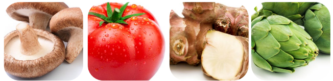
Shiitake mushroom Tomato Jerusalem artichoke Artichoke