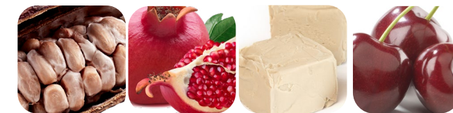
Cocoa bean Pomegranate Beta-glucan Sour cherry