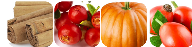
Cinnamon Cranberry Pumpkin Rose hips