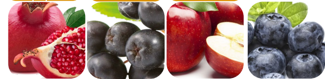
Pomegranate Aronia Apple Blueberry