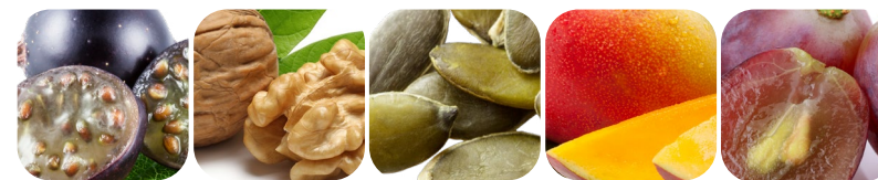
Blackcurrant seed oil Walnut oil Pumpkin seed oil Mango Grape seed