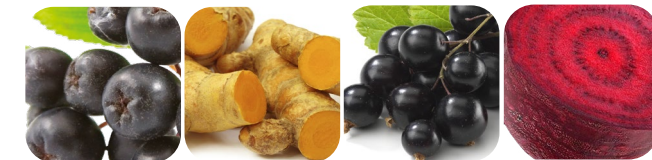
Aronia Curcuma Blackcurrant Beetroot