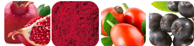
Pomegranate Astaxanthin Rose hips Aronia