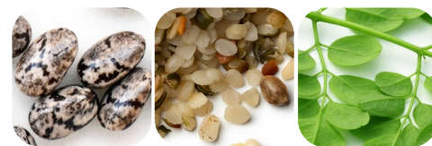
Chia seed oil Hemp seed oil Moringa oleifera