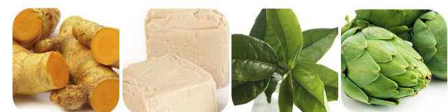
Curcuma Beta-glucan Green tea Artichoke