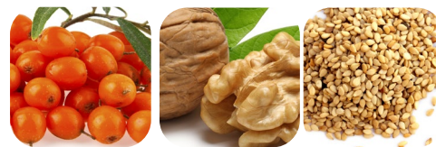
Sea buckthorn pulp oil Walnut oil Sesame seed oil