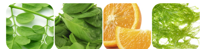
Moringa oleifera Spinach Orange Spirulina algae