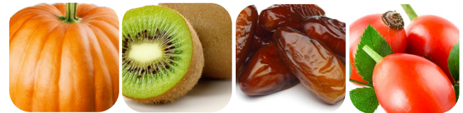
Pumpkin Kiwi Date Rose hips